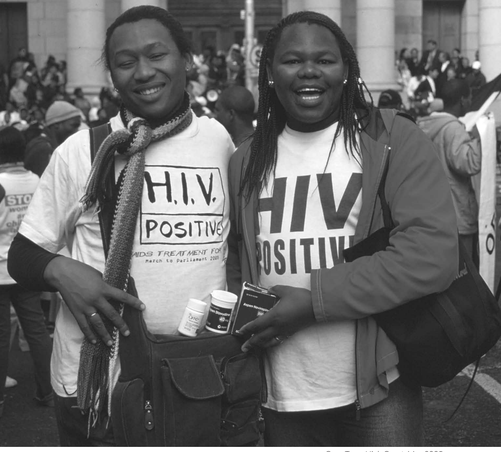
Cape Town High Court, May 2005

HIV-infected Africans" (Jungar & Salo, 2008:98). The Red campaign markets social difference. The Red T-shirt conjures up an image of Africa as a place of death and victimhood, and a corollary vision of the West as a vibrant, animated world which has the power to save. By contrast, the 'HIV-POSITIVE' TAC T-shirt makes it impossible to distinguish between 'them', the infected, and 'us', the presumed uninfected, and therefore also to distinguish between victims and saviors.