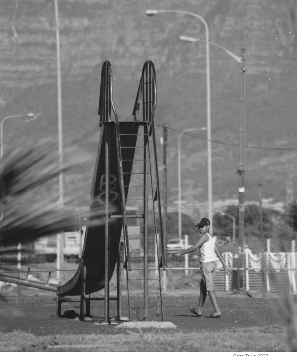
Cape Town 2003