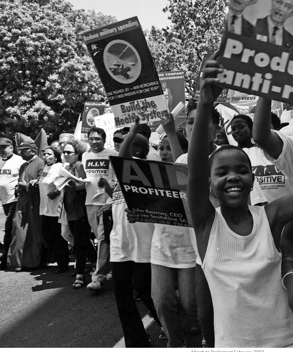
March to Parliament February 2001