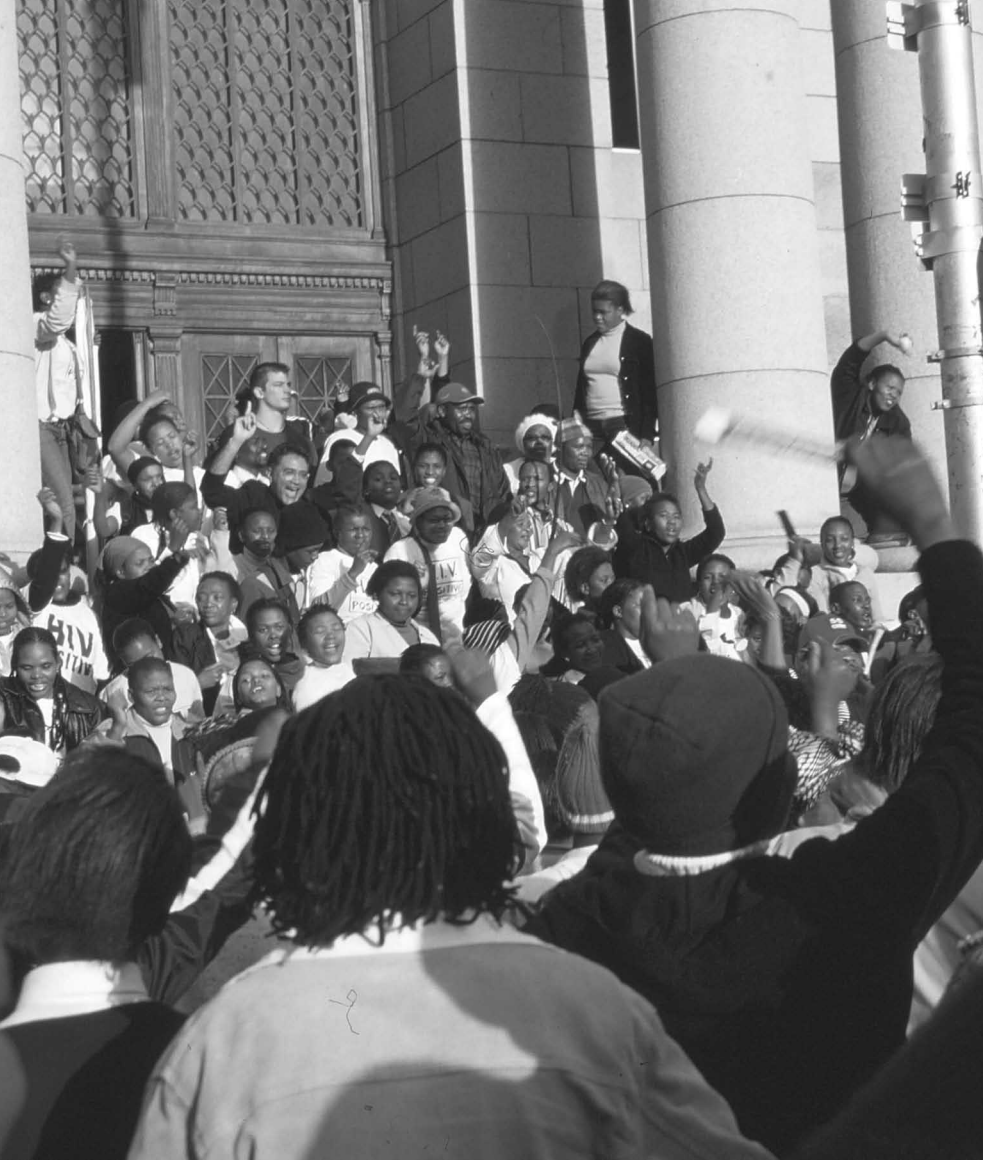
Cape Town High Court, May 2005