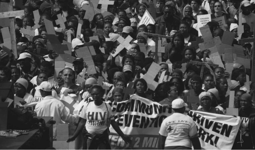
March to Parliament, September 2006