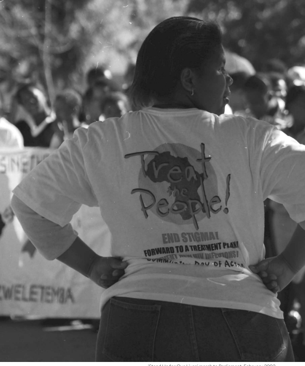
'Stand Up for Our Lives' march to Parliament, February 2003