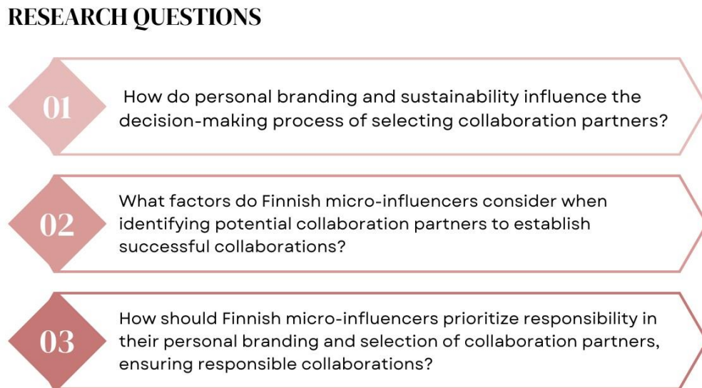
Figure 1. Research questions

The study aims to examine Finnish micro-influencers decision-making process when identifying suitable collaboration partners and the factors influencing the identifying process, particularly emphasizing personal branding, responsibility, and sustainability. The findings aim to facilitate the creation of successful and responsible collaborations between micro-influencers and brands, providing insights into the evolving landscape of influencer marketing. To accomplish the purpose of this thesis, the topic is approached with the help of three specific research questions presented in Figure 1.