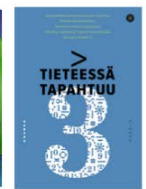
Tieteessä tapahtuu VOL 35 NO 3 (2017)