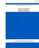
Journal of Structural Mechanics VOL 50 NO 1 (2017)