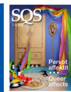
SQS - Journal of Queer Studies in Finland VOL 10 NO 1-2 (2016)