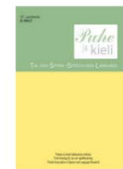
Puhe ja kieli VOL 37 NO 2 (2017)