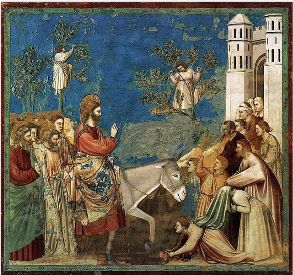
Some days prior to the crucial Passover, Jesus acted out his prophetic sign of entering into the city on an ass. The fact that all the four Gospels retell this episode testifies that his entry was regarded as significant, royal and prophetic. Entry into Jerusalem by Giotto di Bondone, in Arena Chapel, Padoa, Italy, c. 1305.