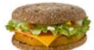
Kasvis Ruis Feast