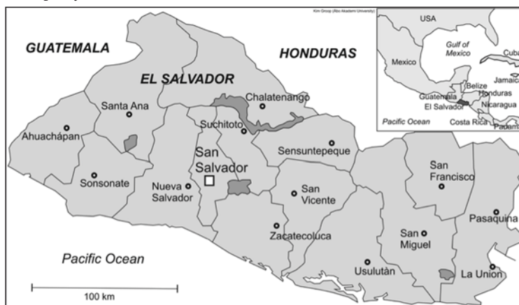
Map 1 of El Salvador and Central America

ministry to women was interesting especially because, on the one hand, the society of El Salvador was marked by a strong macho culture and, on the other hand, the Lutheran Church of El Salvador had from its beginning been characterised by a conservative theology until the 1980s. In 2009, women had more significant posts on several levels in the church than ever before. In the same year, the responsibility for the Mutirão process, which aimed at the restructuring of the Lutheran Church of El Salvador, was transferred from the Lutheran World Federation (LWF) to the Lutheran Church of El Salvador itself. This turning point in 2009 serves as the final point of my research.