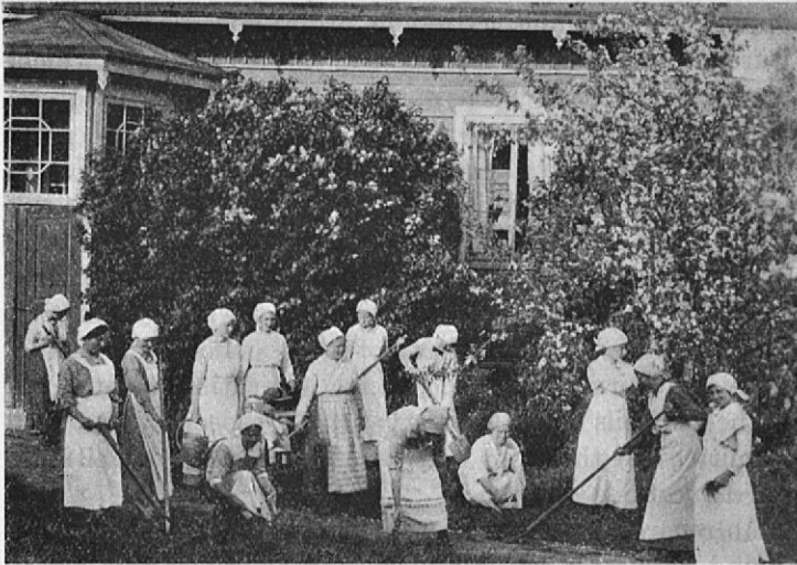
Karkku, School of gardening.

school at Högvalla were the only more important institutions. It was, therefore, quite natural that the women members of the Diet tried to make improvements in this respect. Thanks to their efforts the Diet granted increased subsidies to the housekeeping schools, while the government charged a committee with the preparation of a report on the organisation of instruction in domestic economy. At present a complete state institute for domestic economy