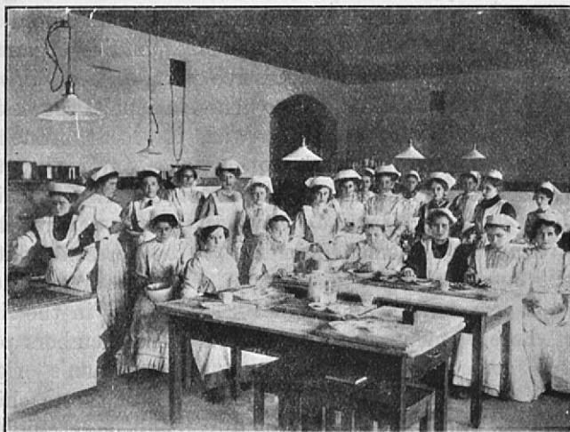
Tampere School of Housewifery.

bearing on the management of the home. Rational house-keeping comprising all classes of the people is no doubt extremely valuable from the point of view of political economy. The unmethodical management of homes which still prevails causes all the greater losses, as it is as a rule the housewife herself who does the buying. Also from an educational point of view it is essential that the mother is well conversant with her tasks: the authority