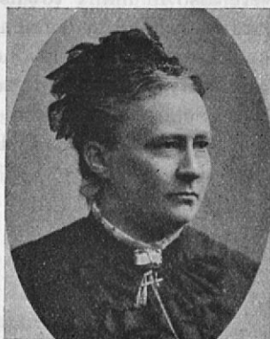
Mrs. Minna Canth.

All the above-named wrote in Swedish but in due course a protest in the Finnish language was also raised against existing conditions. In vivid colours and with moral indignation Minna Canth described in » Työmiehen vaimo » (the labourer's wife) and other works the position in which the law places a helpless woman, bound to a bad husband. She pictured with shocking realism the poverty and misery in working-class homes, and the lamentable life of the poor wife. In » Hanna » and » Papin Perhe » (The Clergyman's Family) she gave a pathetic description of woman's inferior position even in educated families. The discussion of women's rights, which had become