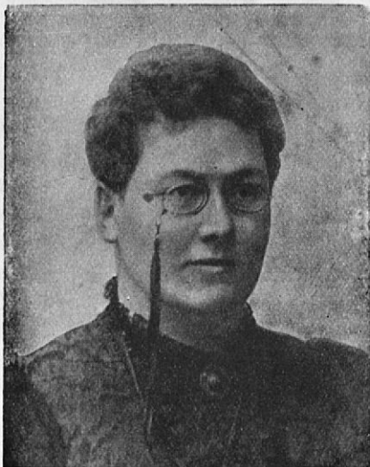
Baroness Alexandra Gripenberg.

During the periods 1889 to 1904 and 1909 to 1913 Baroness Alexandra Gripenberg (died 1913) was the leader