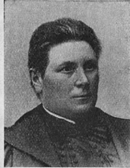
Lucina Hagman, headmistress.

In 1892 a new association was founded for the protection of women. It was called the Women's »Union» of Finland, its first president being the headmistress Lucina Hagman . With regard to legislative reforms the »Union» took the initiative in improving the laws regarding the position of illegitimate children, married woman's majority and right to property and woman's political franchise and communal eligibility. The »Union» also worked for the appointment of women trade inspectors, the right for women to become pharmacists and to act as guardians. Furthermore the »Union» initiated sewing meetings for mothers, lectures for working women, arranged work for the unemployed and in general worked for the improvement of industrial knowledge by means of classes for sewing, weaving, etc. and by distributing work in the homes. The meetings, arranged by the »Union» for lectures and debates, where all questions pertaining to the women's movement were deliberated and explained, were of great importance.