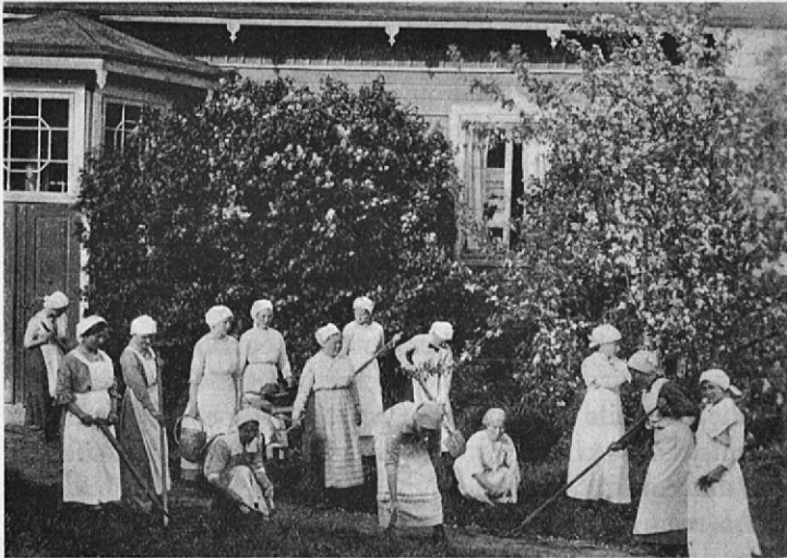
Karkku, School of gardening.

school at Högvalla were the only more important institutions. It was, therefore, quite natural that the women members of the Diet tried to make improvements in this respect. Thanks to their efforts the Diet granted increased subsidies to the housekeeping schools, while the government charged a committee with the preparation of a report on the organisation of instruction in domestic economy. At present a complete state institute for domestic economy