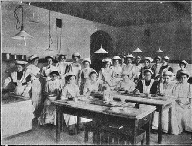
Tampere School of Housewifery.

bearing on the management of the home. Rational house-keeping comprising all classes of the people is no doubt extremely valuable from the point of view of political economy. The unmethodical management of homes which still prevails causes all the greater losses, as it is as a rule the housewife herself who does the buying. Also from an educational point of view it is essential that the mother is well conversant with her tasks: the authority