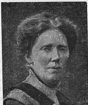
Dr. Tekla Hultin.