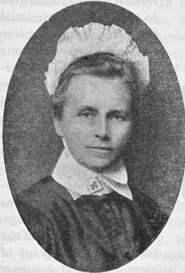
Baroness Sophie Mannerheim.

Nearly all the women's organizations in Finland work in one way or another for the care of children. The foundation in 1920 of General Mannerheim's League for Child