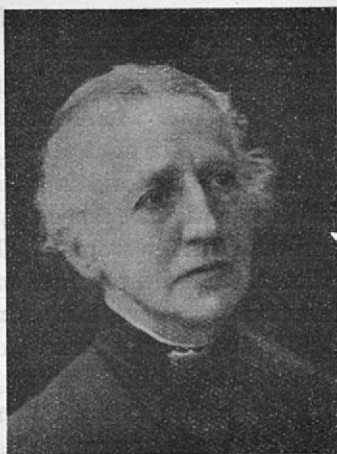
Baroness Mathilda Wrede.

extensive work of education through its 30 local branches. It aims at stimulating women's interest in communal life. The Helsingfors branch is keenly interested in questions connected with the extension of women's rights. Some of the branches specialise in housekeeping, others in the protection of children by supporting homes for children, etc. One of the branches has founded a summer home for working class mothers. The founder and