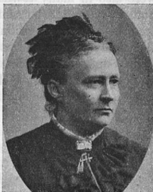
Mrs. Minna Canth.

All the above-named wrote in Swedish but in due course a protest in the Finnish language was also raised against existing conditions. In vivid colours and with moral indignation Minna Canth described in » Työmiehen vaimo » (the labourer's wife) and other works the position in which the law places a helpless woman, bound to a bad husband. She pictured with shocking realism the poverty and misery in working-class homes, and the lamentable life of the poor wife. In » Hanna » and » Papin Perhe » (The Clergyman's Family) she gave a pathetic description of woman's inferior position even in educated families. The discussion of women's rights, which had become