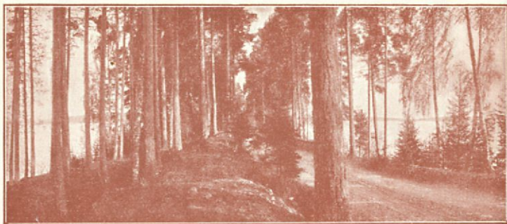
The Punkaharju Ridge.