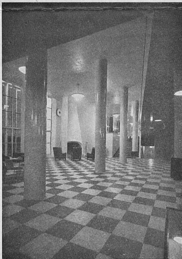
Entrance-hall of Hotel Pohjanhovi.

For all those seeking a change and holiday among the life-giving Northern nature, Rovaniemi offers