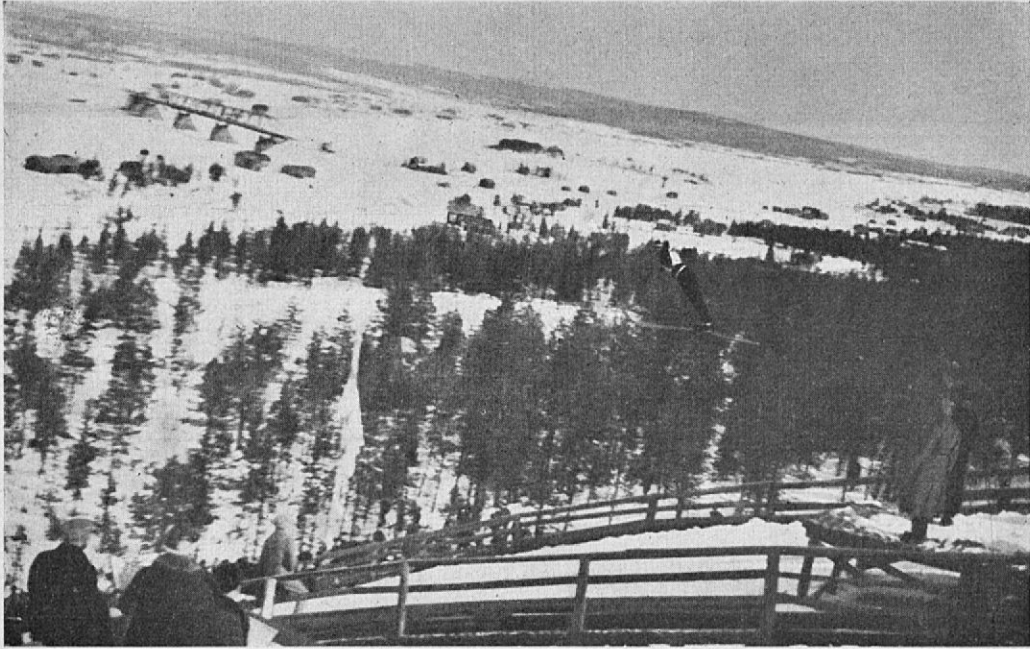
A jump in mid-air from the Ounasvaara ski-jump.