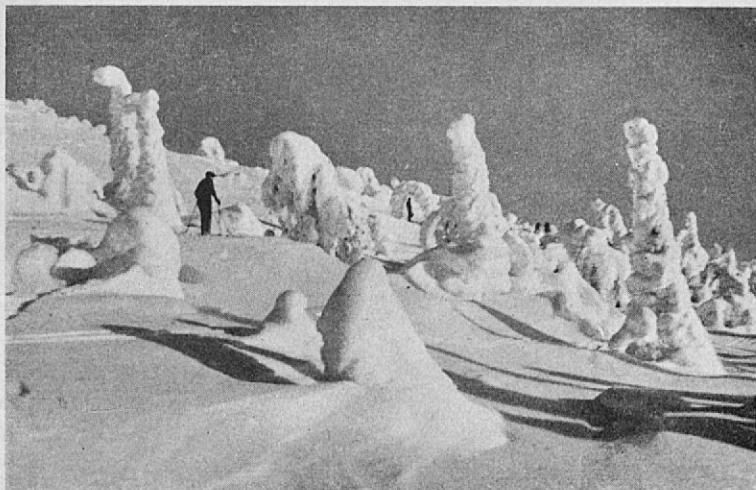
Skiing in Northern Finland.

(Reprinted from 'Finnish Trade Review' - Sept. 1936.)