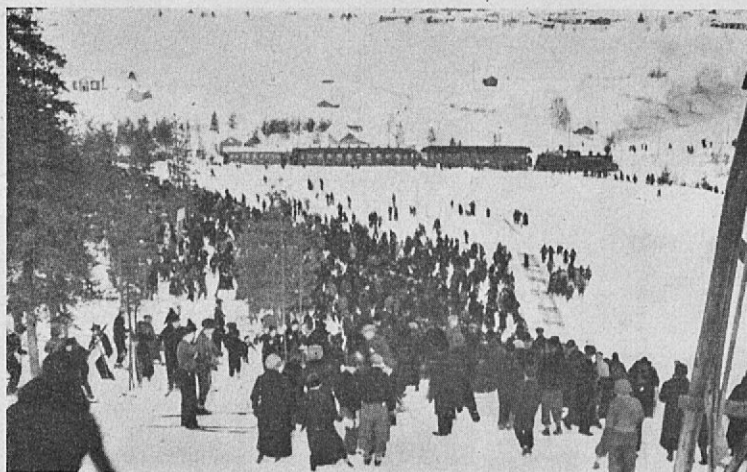
Ounasvaara Winter Sports Meeting.

In addition to the unconquered beauty of nature in these regions the wild reindeer of the Polar