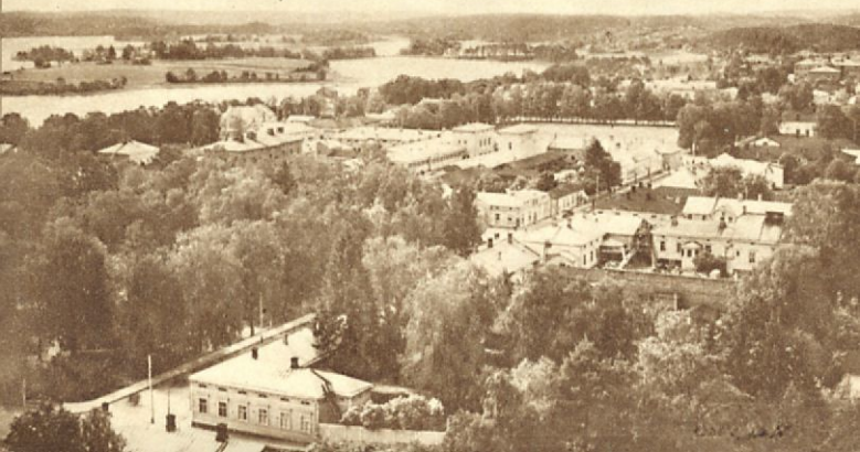
General view of Mikkeli.

Of the SIGHTS OF MIKKELI we might mention the water-tower situated on Naisvuori Hill in the town itself, from the top of which there is an extensive view over the town and its surroundings. At the foot of the tower is the