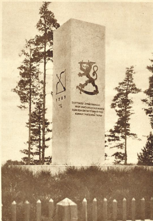
Monument on Porrassalmi battlefield.