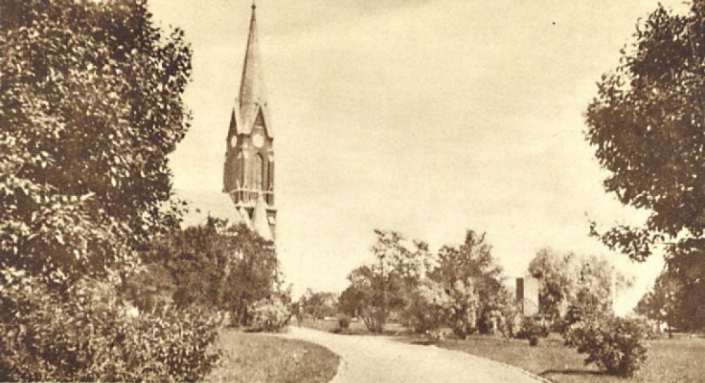
The town church and surroundings.

beautiful place in the vicinity is Lamposaari island, on which there is a popular summer restaurant. The tourist will doubtless carry away with him a permanent memory of a visit to the famous battlefield of Porrassalmi. The road there leads through a lovely landscape, and arrived there the tourist sees opening before him one of the most beautiful bits of the interior, with waters glittering between high ridges and verdant fields. At the highest point of one of the ridges soars a monument, a reminder of the battles the Finns have had to endure in defence of their fair country. A villa on the bank of the straits has been furnished as a comfortable summer restaurant. While visiting Porrassalmi the opportunity can be taken to visit the Invalids' Home situated in the old manor of Kyyhkylä.