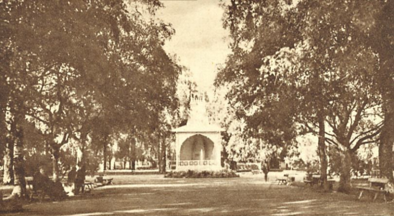
The Church Park.

THE TOWN OF MIKKELI has begun to attract the attention of tourists in ever increasing degree during recent years. And well, indeed, it deserves this attention, for situated as it is beside beautiful tourist-routes or at their termination, Mikkeli, as the clean and up-to-date capital of an inland province, offers to tourists a peaceful and comfortable resting-place on their journey.