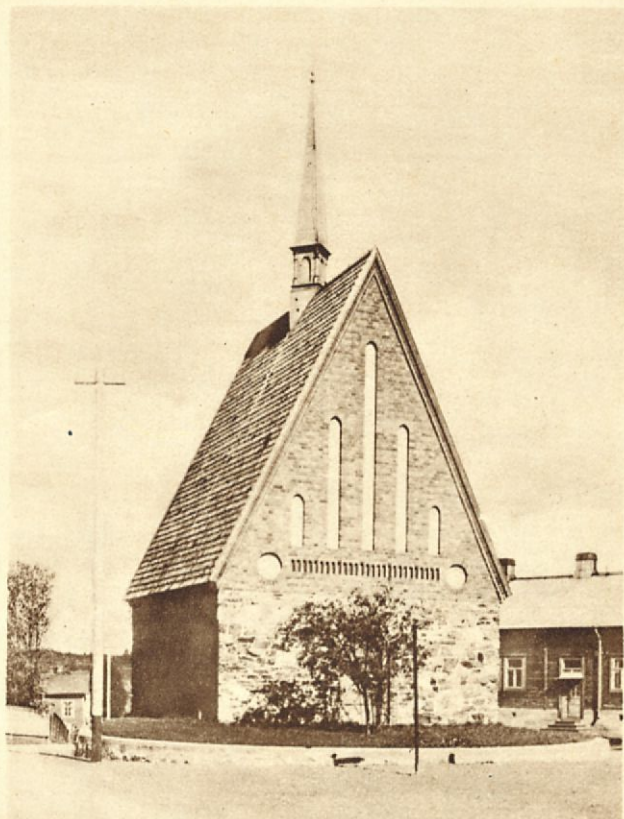
The »Stone Sacristy».