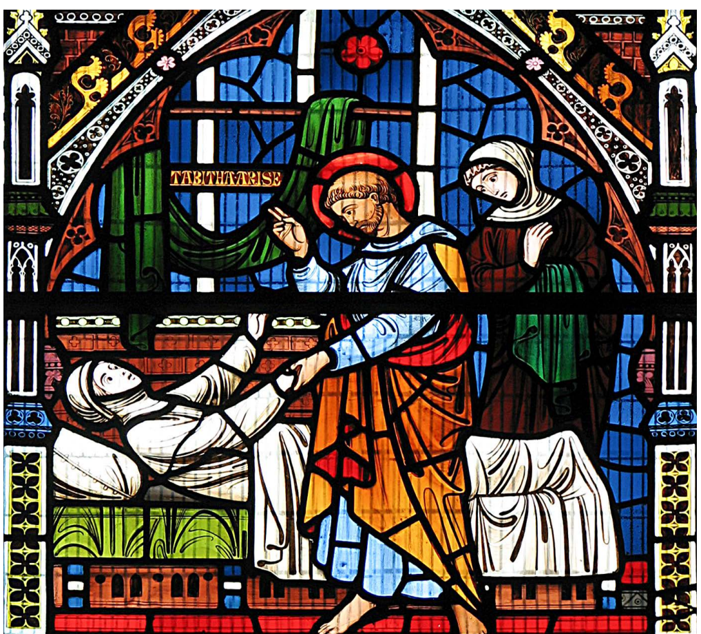
Peter raising Tabitha. Detail from a window in Ely Cathedral.

deeds attract attention, demonstrate that he is a divine agent and lead to mass conversions in both Jerusalem and Lydda (Achtemeier 2008, 160, cf. 216). The healing at the temple leads also to persecution, as Peter and John are jailed overnight and interrogated by the Jewish rulers (Acts 4:1– 22; Myllykoski 2006, 161–62; Pervo 2009, 96). In addition, Peter receives a vision telling him not to regard non-Jews as unclean (10:9–16, 34–35), is broken out of prison by an angel (5:17–29; 12:1–11), has his mere shadow recognized for its healing powers (5:15–16) and dramatically announces the deaths of Ananias and Sapphira (5:1–11).<sup>18</sup>