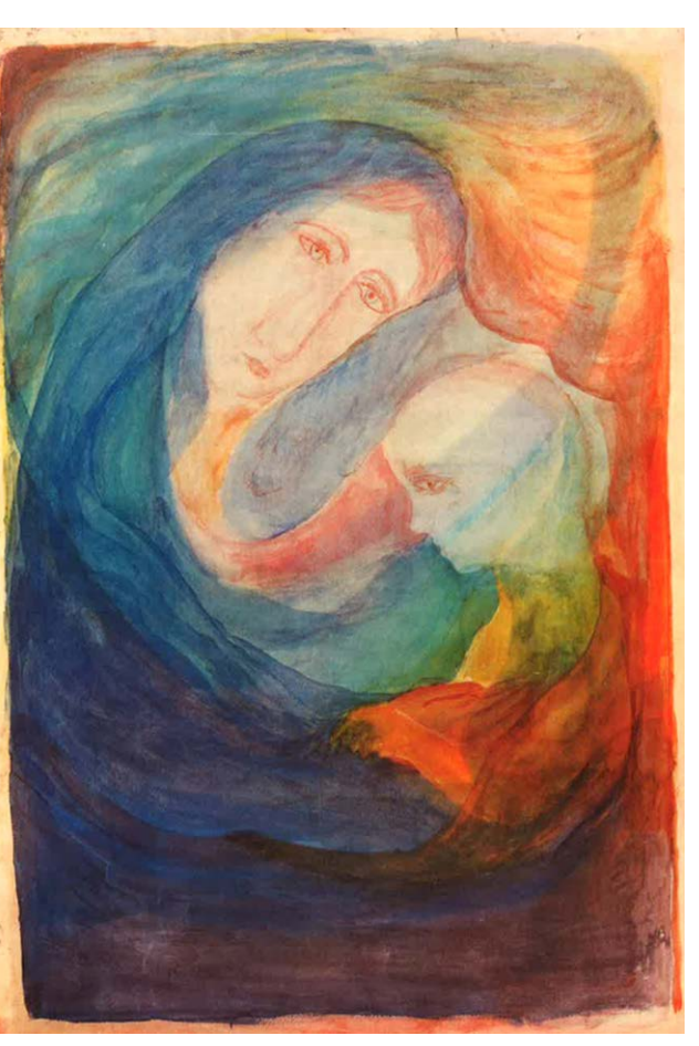
Rudolf Steiner, New Life (Mother and Child) , 1924 (Stebbing 2022, 42).

orders, various cultic practices and a multitude of gods and goddesses whose voices could not be clearly heard and understood. There were initiates in this phase who were waiting and preparing for a sacred birth by assuming that, through divine intervention, the evolution of humanity could receive a new impulse and it could be renewed and enlivened (Lord 2017, 1). The title of Steiner's painting New Life can be associated with incarnation, the word transforming into flesh.