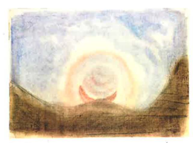
Rudolf Steiner, Nature Mood sketches: Moonrise (1922) and Moonset (1922) (Stebbing 2008, 98).