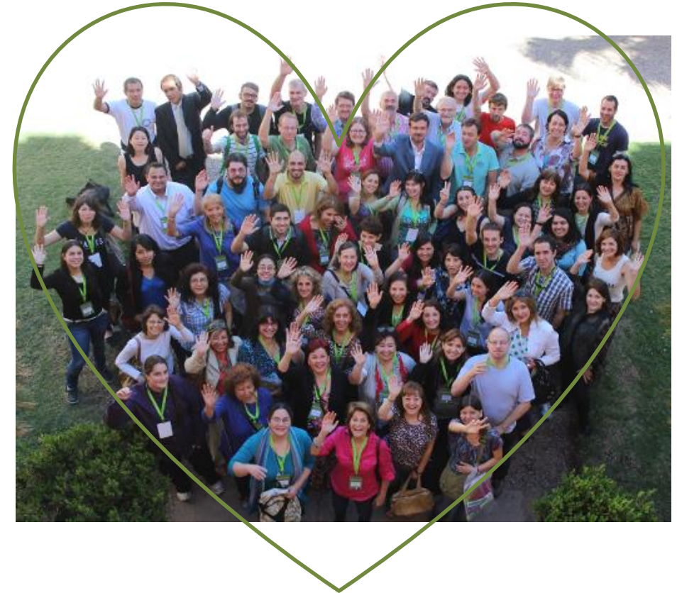
KohaCon14, Cordoba (Argentina)

You are not a developer? Doesn't matter!