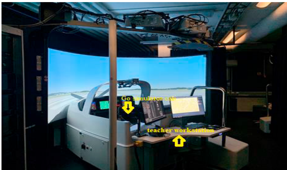
Fig. 1. Illustration of the Go simulator cab, visual system and teacher workstation behind.

The cockpit environment of the simulator is almost identical to the cockpit of a real aircraft. The avionics panel of the simulator is according to the avionics panel of the real airplane panel. An identical simulator is not. However, it is not sensible or cost-effective to copy all the things from a real airplane to the simulator. One example is a teacher's seat that is out of the simulator cab because in the simulator, the teacher's workstation is behind a cab on a separate desk where teachers view and control is better see Fig.1.