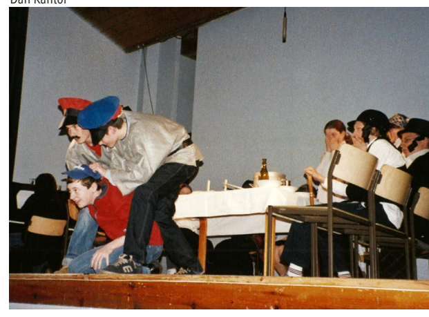
In the autumn of 2003, students at the Jewish school in Helsinki perform the Yiddish-language play Bobe Maises - to great acclaim.

institutional and historical structures and everyday practices, normative regulations and practical adaption, conformity and innovation – the project strives to create a versatile and varied data set. Vernacular religion is never as neatly categorised, unified and structured as it appears in textbook accounts of religious traditions. Rather, it is 'real, particular and often messy' (Gregg and Scholefield 2015: 7). Hence, a corpus of data pertaining to the everyday life of persons who are not religious professionals is optimal. The research material for the current project consists of: