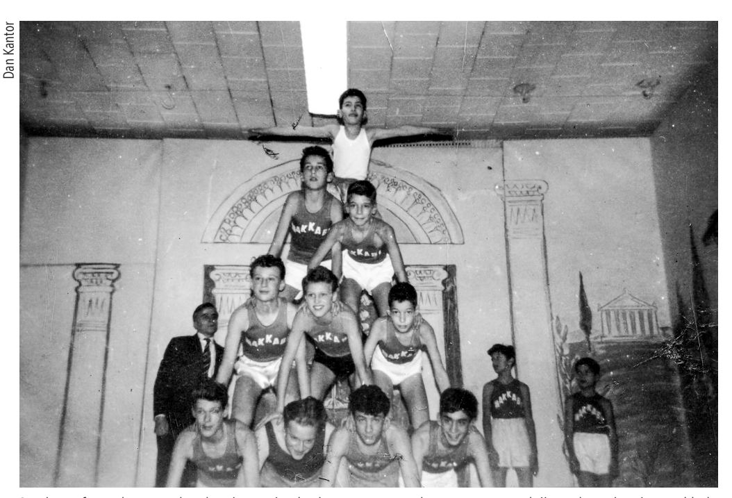
Students from the Jewish school in Helsinki demonstrating their gymnastic skills at the school Hanukkah celebration of 1959.

An interesting aspect of the archive material, which aids the Nordic comparative analysis, is the fact that most of the large archival materials are written in Swedish and contain Nordic parallels in themselves, for example, decrees from various Nordic communities and cross-references to Nordic siddurim. As mentioned above, new ethnography must be collected in addition to the existing archive data as comparable oral data