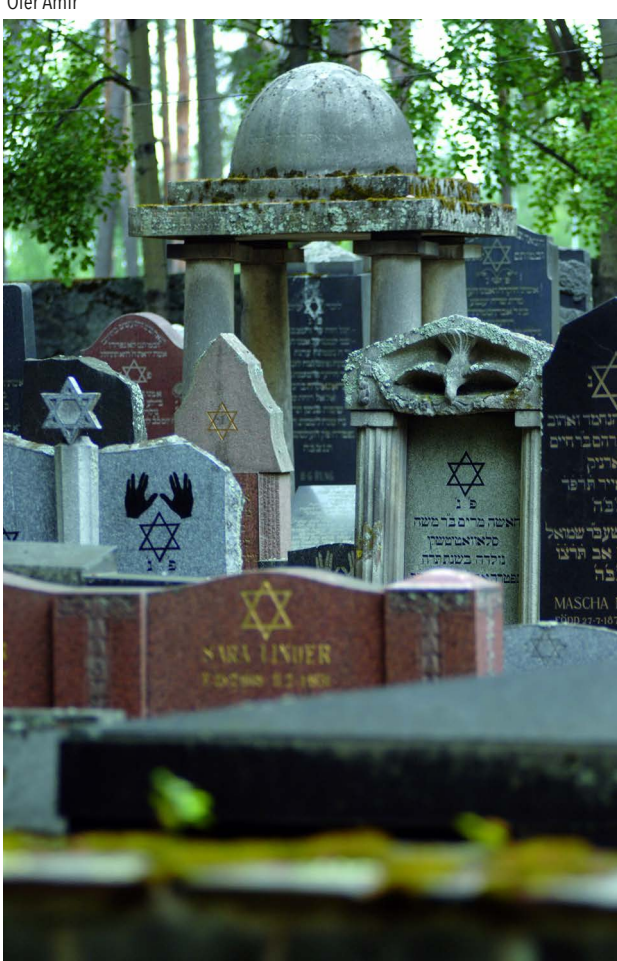
Gravestones at the Jewish cemetery in Helsinki. In earlier times, the stones were engraved in Hebrew. Later on Yiddish was also used and today also Swedish and Finnish.