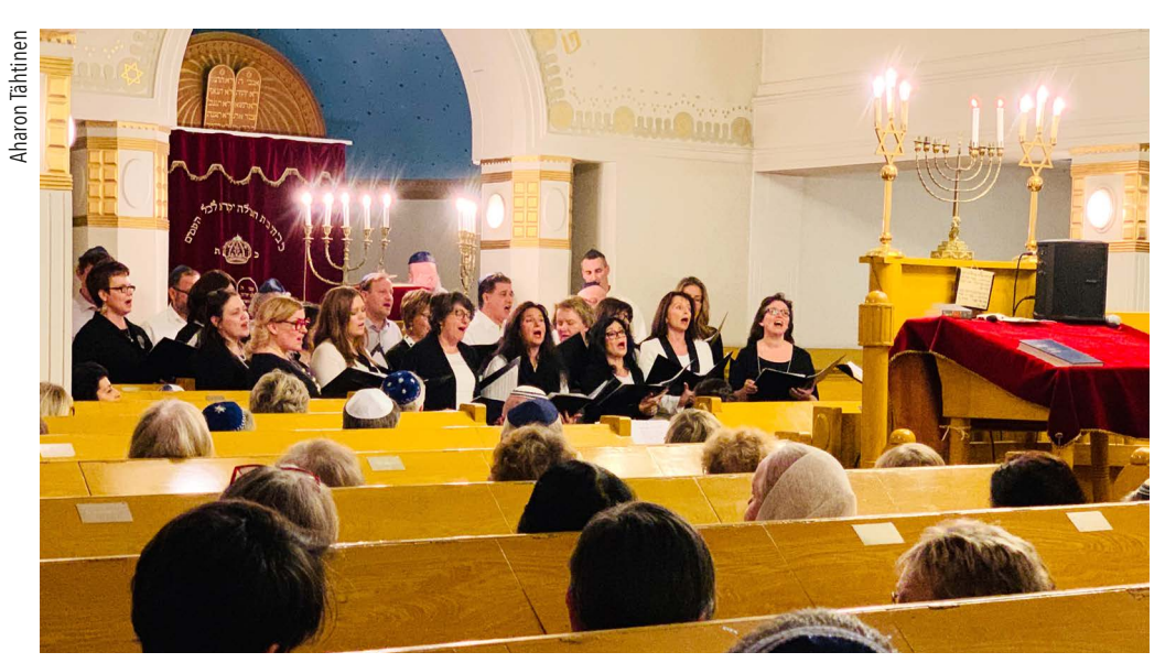
The Hazamir choir performing in the Turku synagogue at Hanukkah 2018. The choir, founded in 1917, is specialised in Jewish music performed in Hebrew and Yiddish.