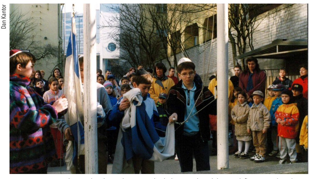
At Yom Ha'atzmaut, the Israeli Independence Day, both the Finnish and the Israeli flags are solemnly raised at the Jewish school in Helsinki. Picture from the 1990s.