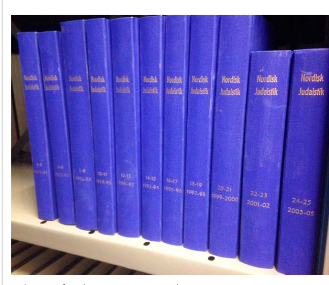
Volumes of NJ between covers in the Donner Institute library.

Also the collective of authors has been marked by diversity from the beginning, both in terms of nationality and academic residence. The 'Nordic' seems to have been interpreted rather loosely from the start: having participated in a Nordic conference qualified you for inclusion in that category. This criterion is applicable to this day, and in a positive way, it seems that inclusive view of what constitutes 'Scandinavian Jewish studies' has countervailed the creation and maintenance of artificial boundaries in this diverse and dynamic, utterly transnational