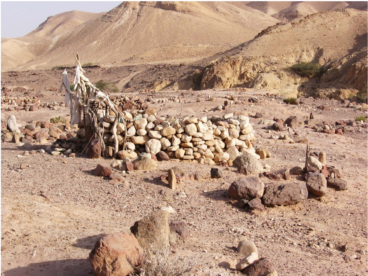
Tombs of the ancestors of the 'Ammarin tribe near Bir Madhkur in Wadi Araba.

In the region the majority of holy sites are the tombs of tribal ancestors, regularly visited by the