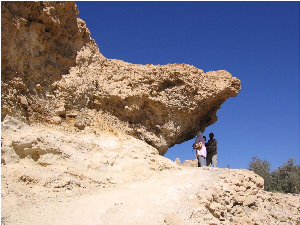
Umm Jadi' in Ma'an.

and it should not be reduced to a mere dichotomy of submission to, or resistance against, the structure.