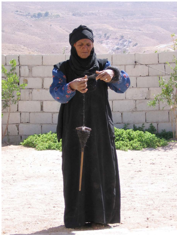
Bedouin woman spinning wool in Baydha.

The projective dimension, as defined by Emirbayer and Mische, offers the opportunity to discuss evaluations of the future based on existing structures that are easily ignored in the research, such as aspirations for the life to come, and personal desires to live a good life on the basis of religious tenets. Such evaluations may result in actions that maintain and