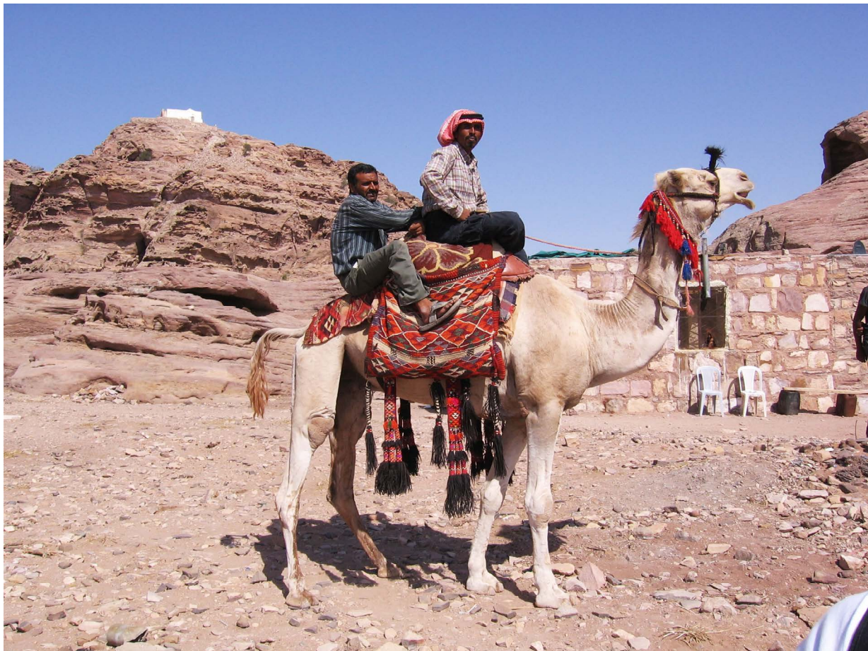
A Bedouin with his camel. Aaron's shrine can be seen at the top left corner.

In addition to Jabal Harun, communal pilgrimages were also organized to other local sites. The women of Wadi Musa organized their own pilgrimage to al-Bawwat (Al-Salameen and Falahat 2009: 189). A large annual pilgrimage was also mentioned in connection to the cemetery at Bir Hamad. The site was visited by the members of the Sa'idiyin tribe, who also camped near the well during their pastoral cycle. The 'Ammarin had their own annual pilgrimage to the cemetery of 'Iyal Awwad. These annual celebrations were also social gatherings. As the families of the nomadic tribes could be separated for the most part of the year, the annual pilgrimage brought all the members of the tribe together.