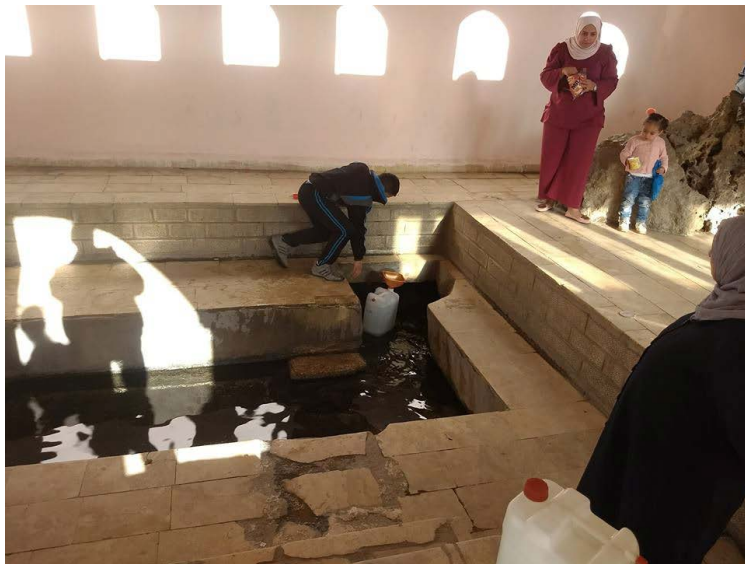
The Spring of Moses in Wadi Musa.

case of a violent death) could incite blood revenge and civil unrest, and thus represented dangerous political agency (Greenberg 2007: 12). On the other hand, excessive crying was also seen as a form of protest against God's will ( ibid. 4). Today, the women in Petra region do not participate in the funeral ceremony. In fact, many do not even enter a graveyard in any situation. They also resent showing emotions while mourning, referring to the necessity of accepting God's will.