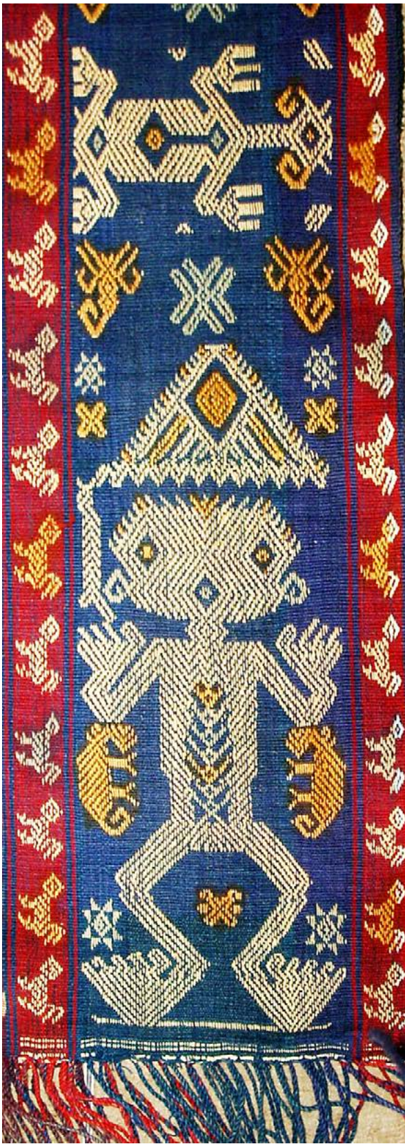
Front view of a detail from a textile from Sumba depicting an ancestor figure (Marapu) using a supplementary of the warp, 1899.

74–6). As we can see, the ideal of sincere speech amounts to a normative ideal of alignment between words and other outer things that emphasize the presence of inner ideals and beliefs over materiality.