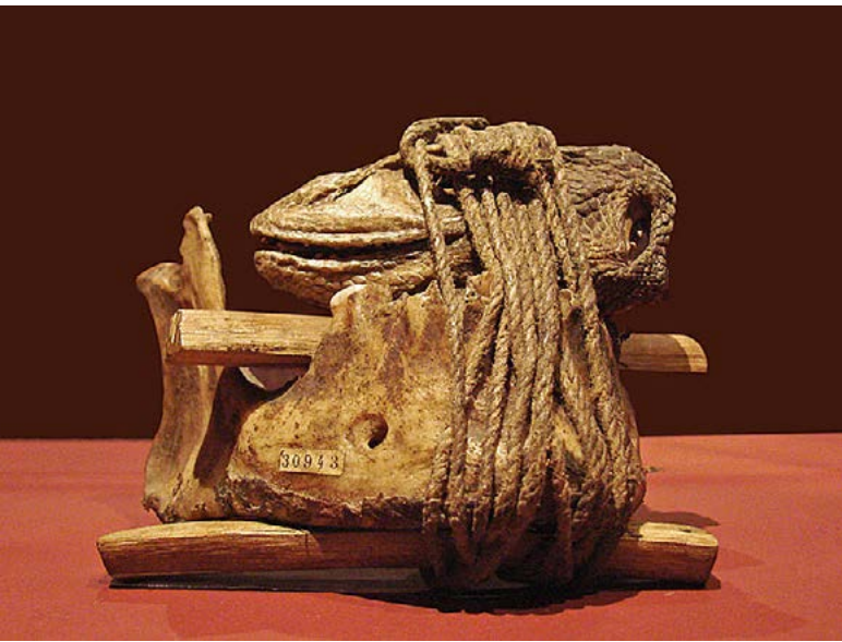
This bo-fetish from Benin shows how bundles of knowledge are binded into fetishes. Notice the similarity between binding external things into a fetish and diagrammatical bundeling of spiritual knowledge in the AQUAL-matrix.

already used the concept of spirituality, a term Tylor had originally considered, he came up with the term animism, which relied heavily on Huxley's ideas. The concept of animism referred to the projection of the human mind onto outer reality, onto inanimate, non-human objects. Whereas primitives looked at things according to such projections, modern science had discerned that objects were separate from the subject. In line with Comptean positivism, Tylor saw that this separation was a first step in cultural evolution. Modern occult sciences and spiritualism in which matter functions as a medium were condemned as evolutionary remnants. (Pels 2012: 35–8)