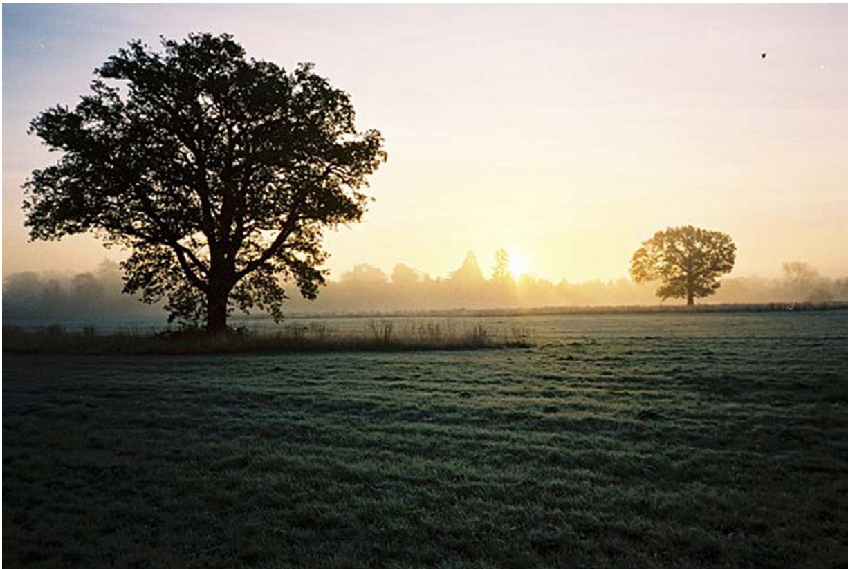
Misty dawn, Maidenhead Thicket, 14.11.2005.