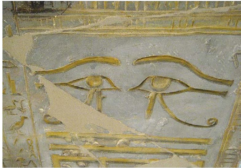
Neues Museum, Berlin.

Eeva Kallio, < https://www.flickr.com/photos/donnaceleste/albums >