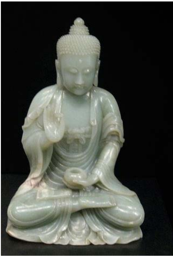
Östasiatiska Museum, Stockholm.

the emergence of spiritual knowing at the interface of human multidimensional cognition, cultural context, subtle worlds, and the deep generativity of life or the cosmos, this account avoids both the secular post/modernist reduction of religion to cultural-linguistic artifact and, as discussed below, the religionist dogmatic privileging of a single tradition as superior or paradigmatic.