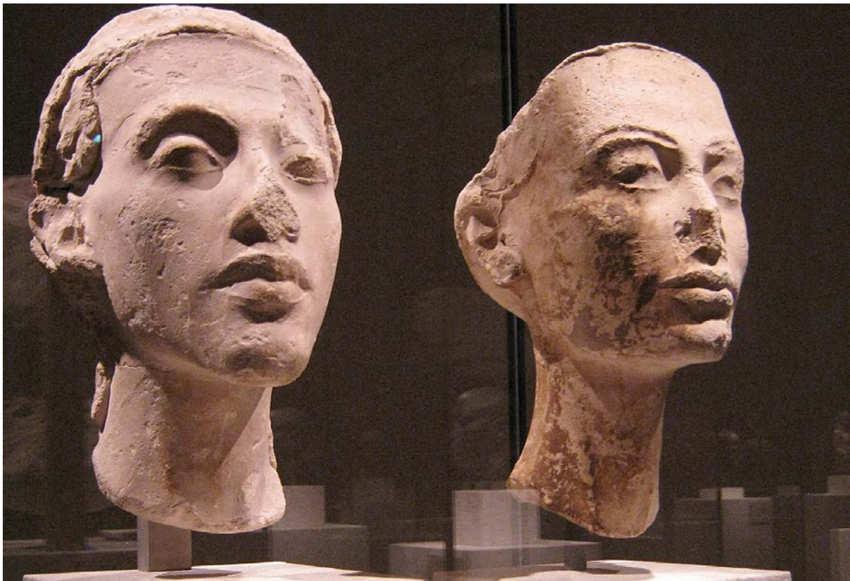
Neues Museum, Berlin.