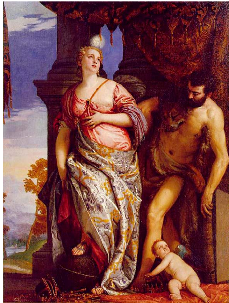
Allegory of Wisdom and Strength , Paolo Veronese, circa 1580. Frick Collection.

has several features which are actually also part of relativistic-dialectical postformal thinking. These features are, for example, contextualism , relativism of values , recognition and management of uncertainty , complex problem solving , tolerance of ambiguity , and dialectical thinking ( ibid. , see also Liitos et al. 2012; cf. Jan Sinnott's definition earlier in this text; Banicki 2009). Relativistic-dialectical integrative thinking seem to be the features which are included both in adult cognitive development and wisdom constructs.