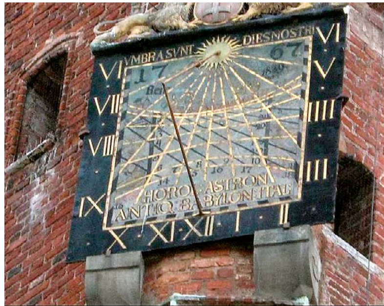
A clock in the Old Town of Gdansk, Poland.

What is essential, therefore, is the interrelationship between these two types of thinking. Are they opposites? Is there any mutual hierarchy? What kind of developmental continuum is there, if any? Whereas in traditional, rationalist thinking Logos is the most prestigious and advanced characteristic, the main point of Labouvie-Vief's model seems to be bridging the gap between Mythos and Logos. She objects to placing reason as the highest developmental achievement. The vertical model with its notion of the