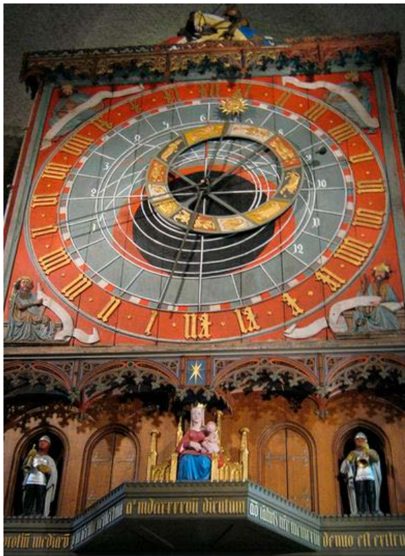
The astronomical clock (detail) at the Lund Cathedral, Sweden.

psychological tradition, the development of the self (or ego) is a lifelong process in which the person creates and defines his or her own limits and choices (Kegan 1982, 1994). At the same time and at many levels, cultural conceptions also play major role in individual development (Bronfenbrenner 1979).