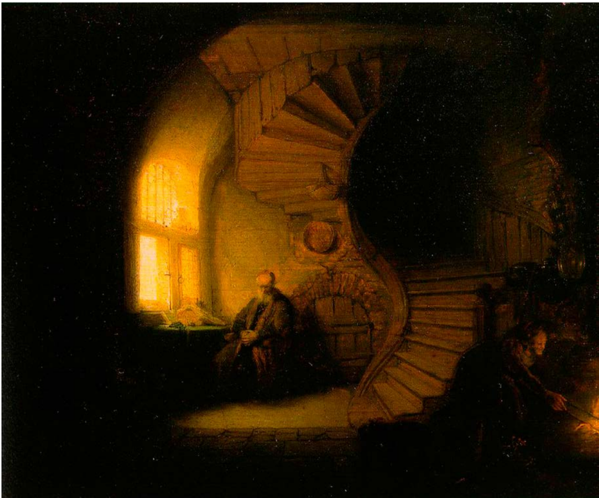
Philosopher in meditation , Rembrandt, 1632. Louvre Museum.