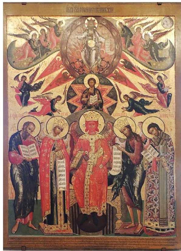
Sofiya Premudrost' Boshiya , anonymous Russian icon painter, 17th century.

practices, which together comprise a dynamic search for meaning, purpose, inner knowledge, deep connection, transcendence and "ineffable" truths that cannot be encoded in words and numbers ' (Robinson 2012: 230, my italics). Spirituality in this sense is thus a phenomenon which cannot be explained to others in ordinary language. However, it is a common statement that there is more than one definition of spirituality (Boyatzis 2012, Watts 2012, Miller 2012).