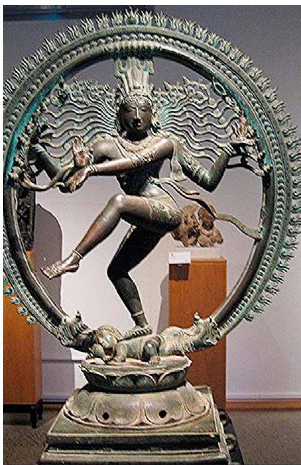
Dancing Shiva, Östasiatiska Museet, Stockholm, Sweden.