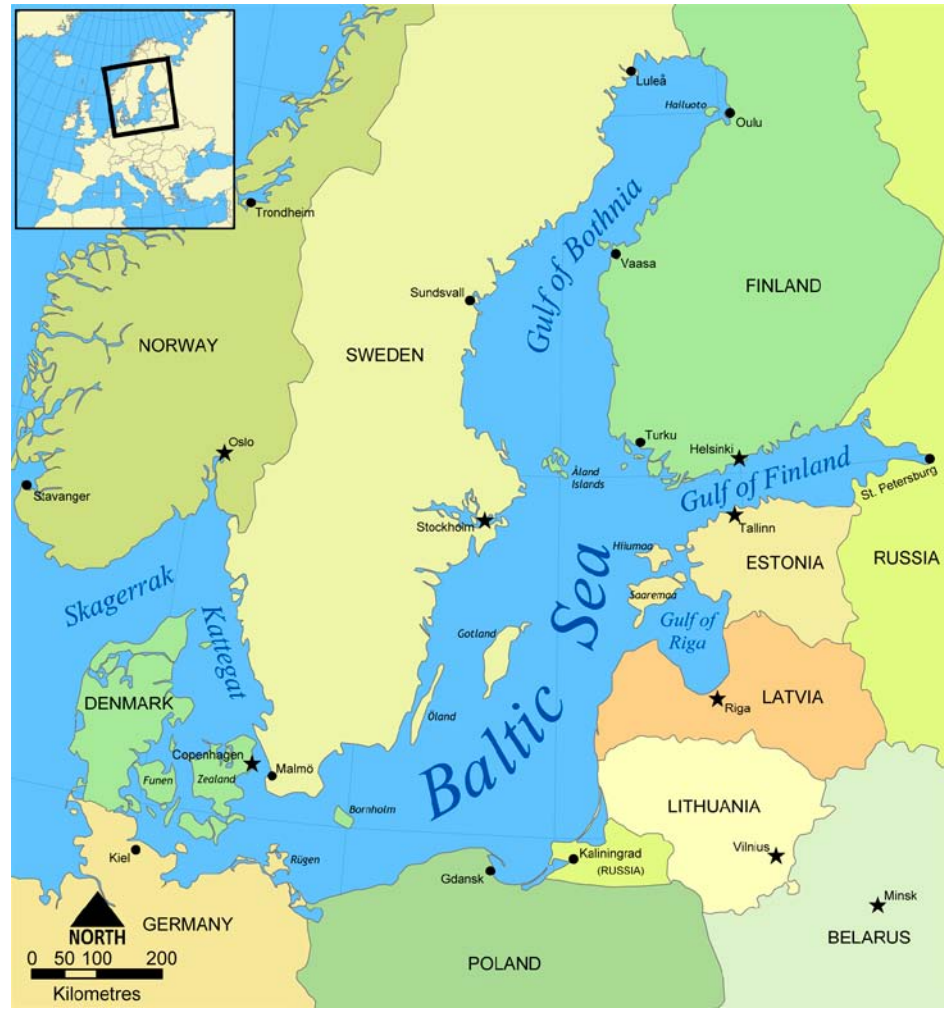
Map of the Baltic Sea.

which take me towards the theme of Pentecostalism in the Baltic Sea region. First, I want to inhabit these generic revivalist categories with some specific history, albeit recent history, covering the years during which I have been studying the Word of Life. In other words, I want to look at how the ministry has developed during the period between the time of its inception as a new revival and the time when it could consciously construct its own history - a history that has both emerged from, and provided a commentary on, the much longer story of revivalist movements in Sweden and beyond. Second, however, I want to see what happens if we extend the underlying metaphors through which we comprehend such revivalism. What if we view it not only through temporal frames, but also through spatial ones (or possibly both combined)? What if we see the Word of Life not only as 'reviving' what it perceives as Swedish Christianity but also as 're-placing' it? And I do mean