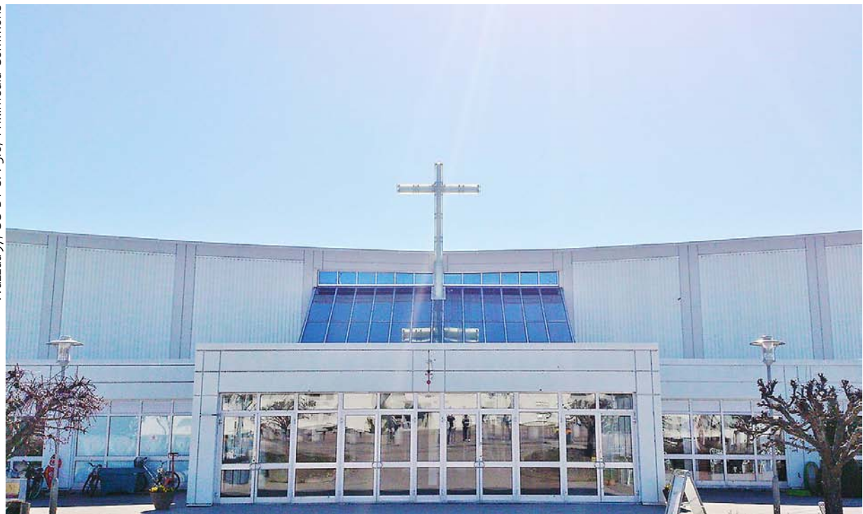
Livets Ord in Uppsala on 23 April 2014.

we can think of it as time-space in its celebration of the scaling-up of activity and broadening of horizons through its producing encounters between Christians across transnational lines.