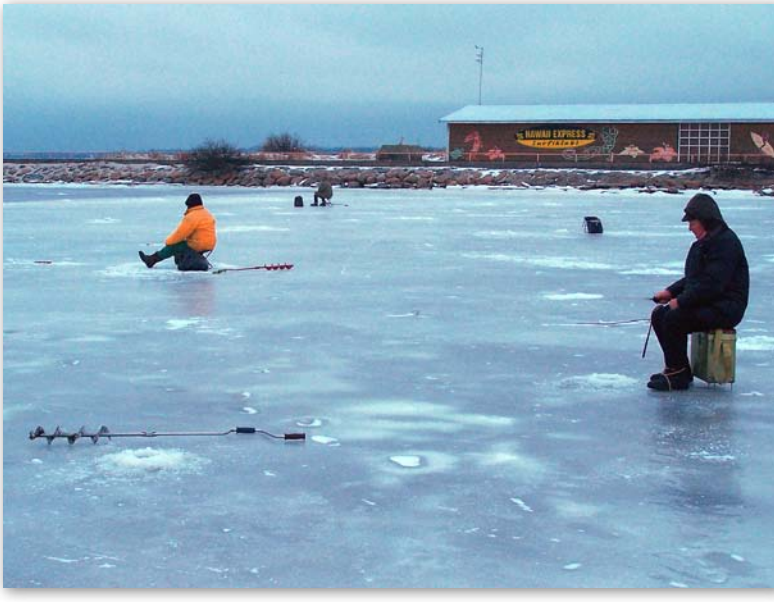
Ethnic groups most likely existed in Prehistory, but we cannot fish them out, since we have no written clues. Ice fishing, Pirita River, Estonia.