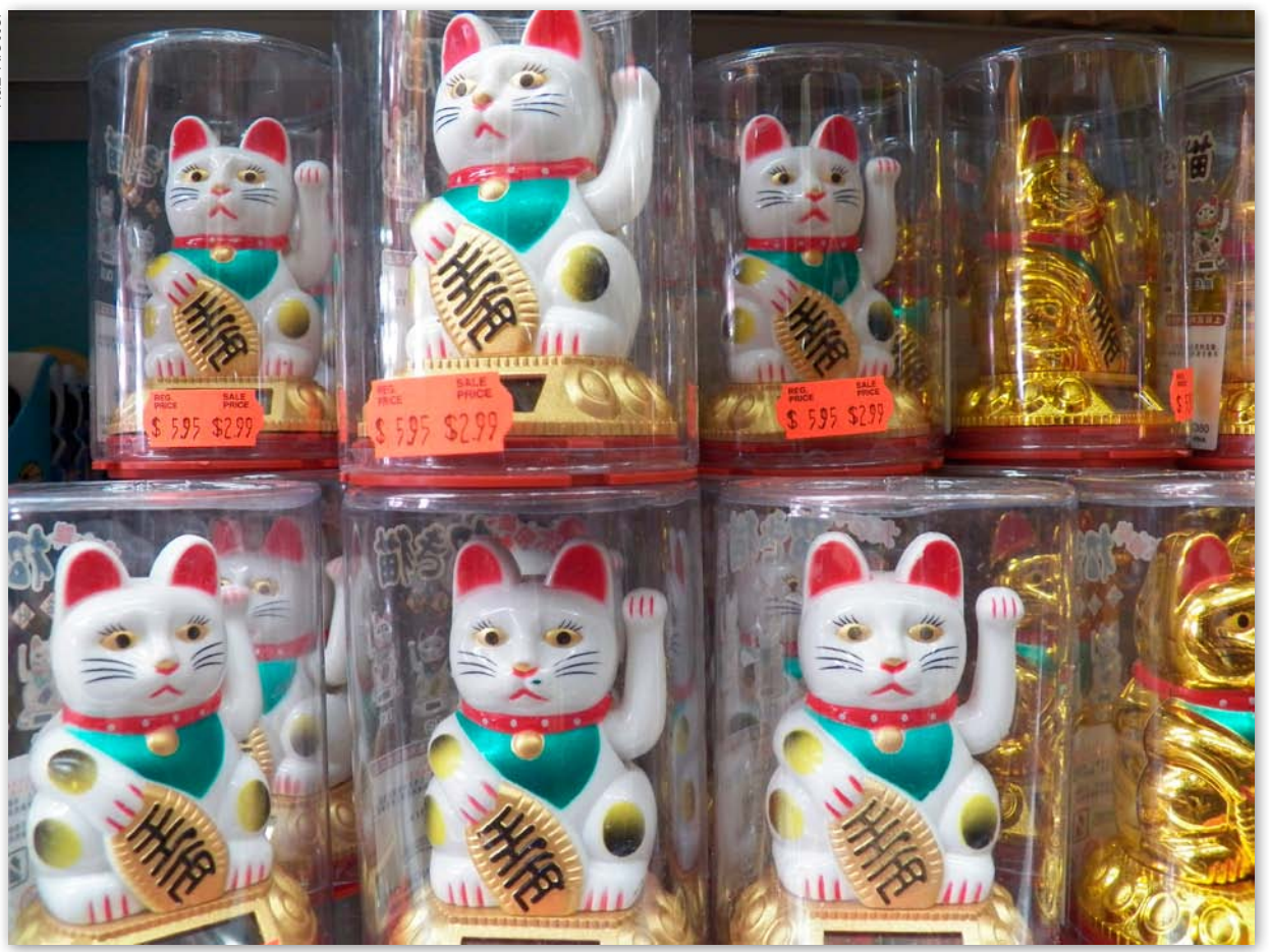
Chinese shop, San Francisco. Any object can be an Ethnic Marker. Not the price, material, shape, or use matter, but the feelings attached to the object.