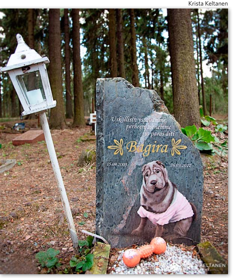
Helsinki pet cemetery.

- excavating this place in 3000 AD. Would s/he be able to retrieve Finnish ethnicity from the material remains?