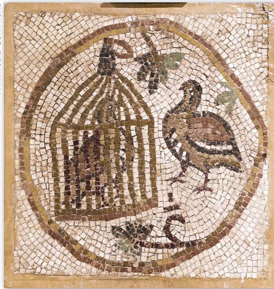
Byzantine Metaphor for the Soul and Death.

that there is an element of the unknown, something that causes uncertainty.