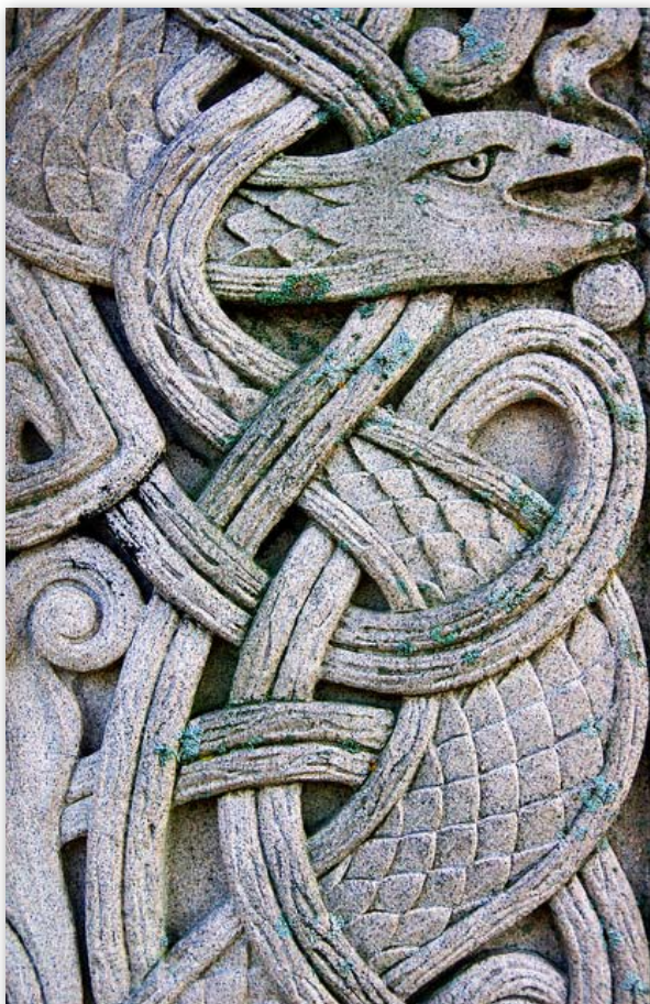
Celtic Knot Serpent. Photo by Wayne Wilkinson.

Creative Commons, Attribution 2.0 Generic