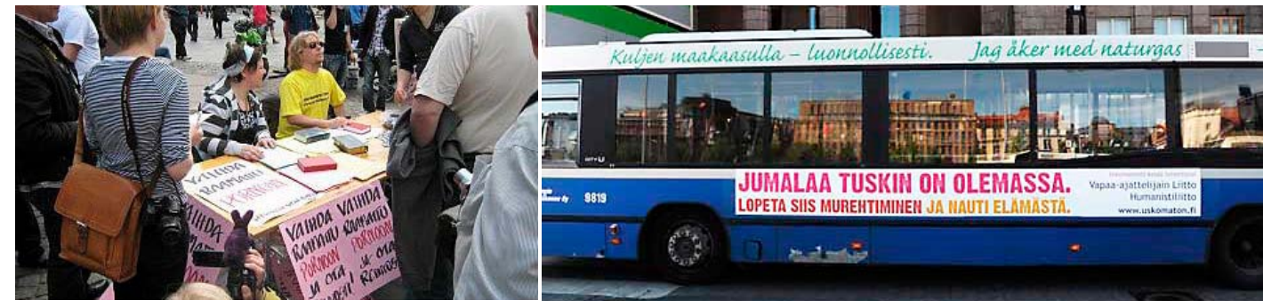
Left: "Swap you the Bible for porn and take it easy!" This campaign in Helsinki was organised by the Union of Freethinkers. A Christian demonstration can be seen in the background. Right: the Finnish atheist bus advertisement campaign of 2009.

tle impact on public policy debate. However, they have made freethinkers and atheists more visible in the public eye and after both the above mentioned campaigns the Union of Freethinkers received more paying members. The provocations have worked as consciousness-raising for some 'closet atheists', but they have also alienated non-religious people. For example, freethinkers from Tampere established a separate association after the 'swapping' campaign, now calling their association 'Equality of Convictions' (or Equality of Worldviews – Vakaumusten tasa-arvo). The main reason for this separation was that they want equal rights for non-religious people without being disrespectful.