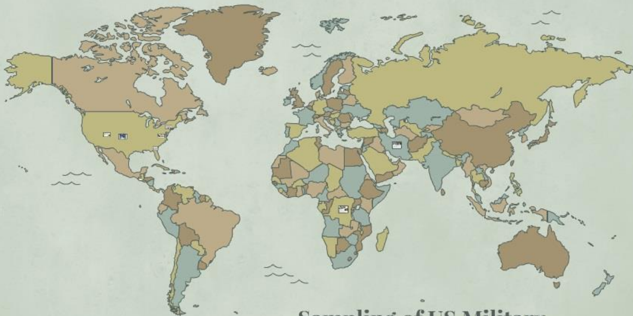
Sampling of US Military Interventions (overt and covert)