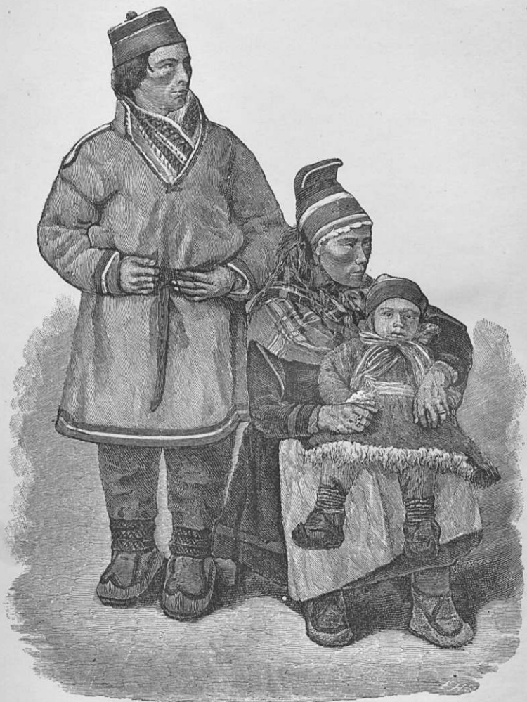
A LAPP FAMILY.