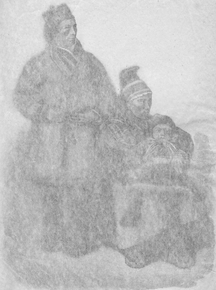
A LAPP FAMILY.