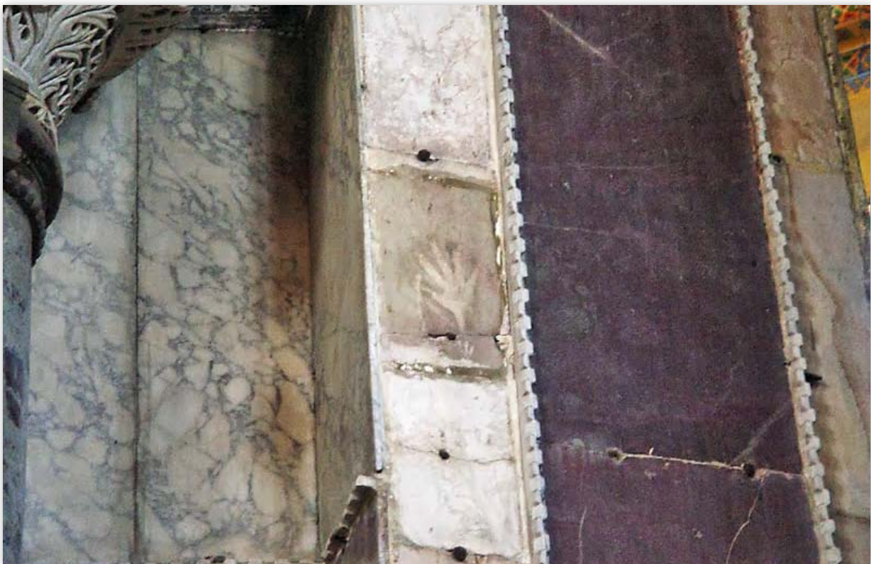
The handprint on the porphyry columns in the south-east corner of Hagia Sophia.