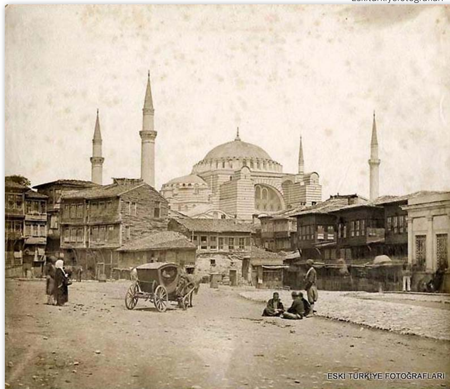
The legends and interreligious relationships.

There are two Turkish legends about respect and disrespect for abdest (a ritual Islamic ablution performed before praying). In one legend, 'The Bloody Spring', a woman lets a saint pass her on the way to a spring so the saint is able to perform abdest at the right time. For this the saint awards her with an endless supply of food. The woman is forbidden to tell her husband about this, but nevertheless she does so and therefore dies. When it is time for abdest , the water in this river becomes red like blood (Alpaslan 2006:13). In another legend 'The Place to Tread', a saint asks an Armenian woman for water