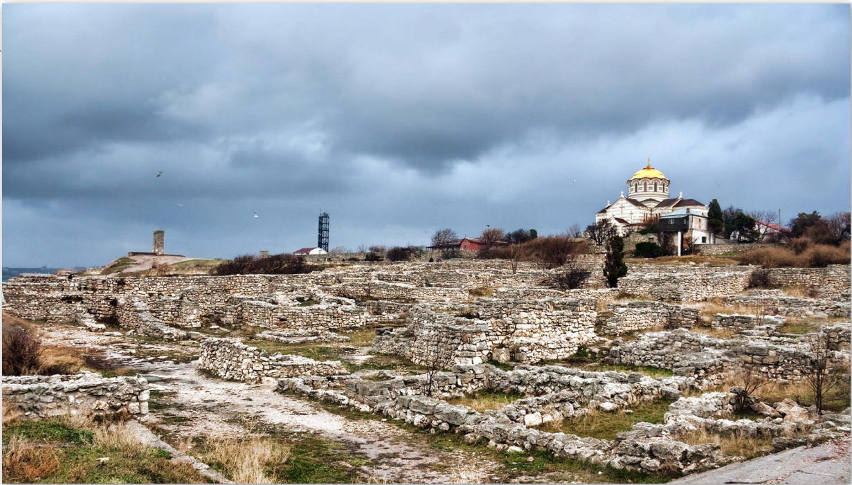
The Cathedral of Saint Vladimir.